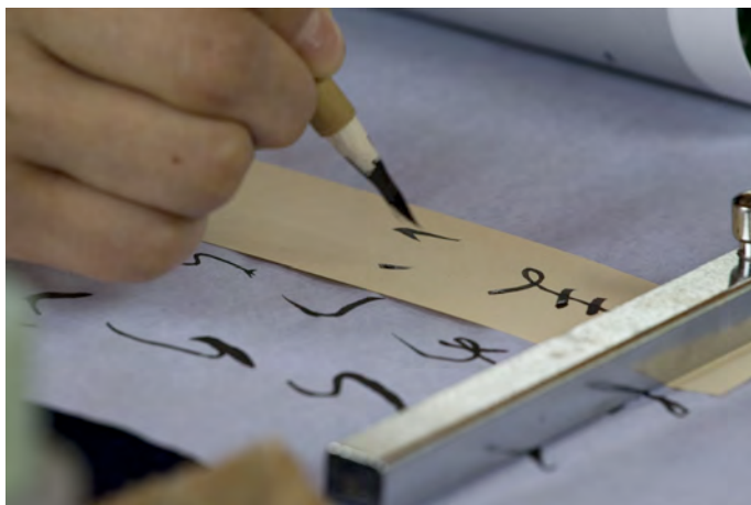
Kurimoto Garden Spring Festival - June 6, 2010