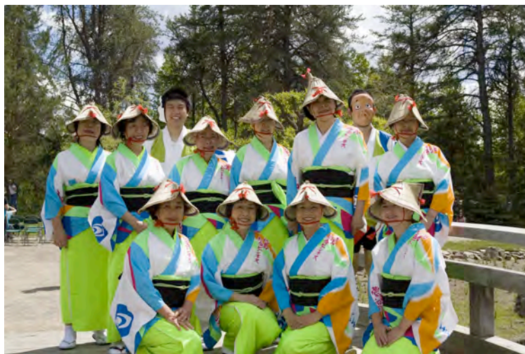
Awa Odori Dance Group at the KG Spring Festival - June 6, 2010

The Board is responsible for conducting the business affairs of the Association and consists of not less than five and not more than 13 persons. The term is two years and the officers (President, First Vice-President, Second Vice-President, Secretary and Treasurer) are chosen by the Board from among its own members.