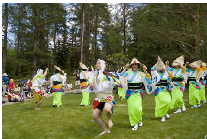
Kurimoto Garden Spring Festival - June 6, 2010