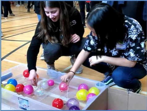
Yo-yo fishing game