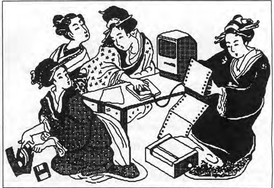
New Moshi Moshi Publishing Team

We hope you like the computer-created logo, artwork and publishing format.