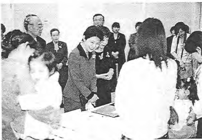
Viewing the Japanese School display