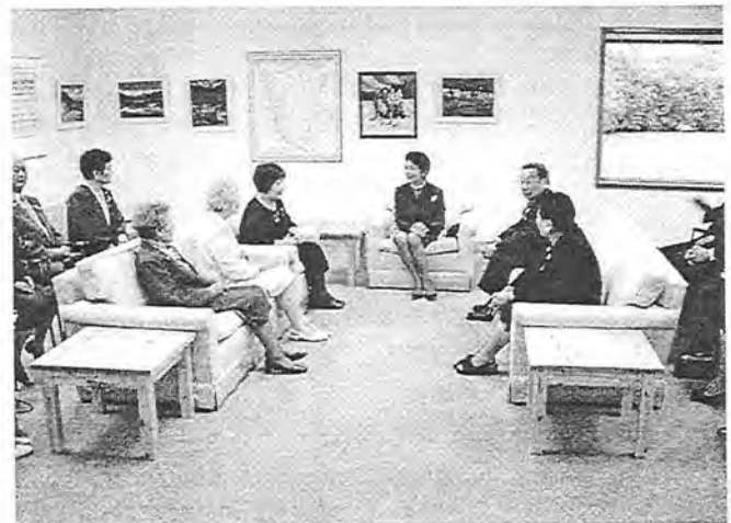
Chatting with seniors