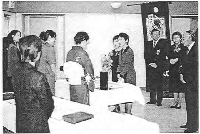
Talking to Wakaba-kai members